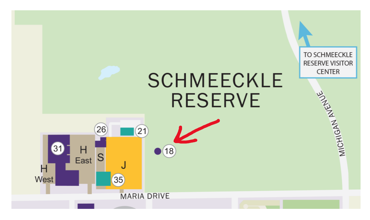
Figure 2. Map of Schmeeckle showing the meeting location at Schmeeckle pavilion, labeled number 18.